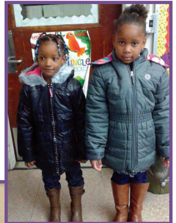
Pictured left and above are children from Ralph Bunch academy on Detroit's East Side showing off their new coats.

For the fourth consecutive year, Local 600 provided winter coats for several local organizations within the community. This year, coats were distributed to New Birth Church of God in Christ, Bridging Communities, Harbor Choice, Mark Twain Elementary, Ralph Bunch Prep Academy, and Urban Life Center. With the help of the UAW, the chosen recipients were provided an opportunity to make it through the cold months of Michigan more comfortably.