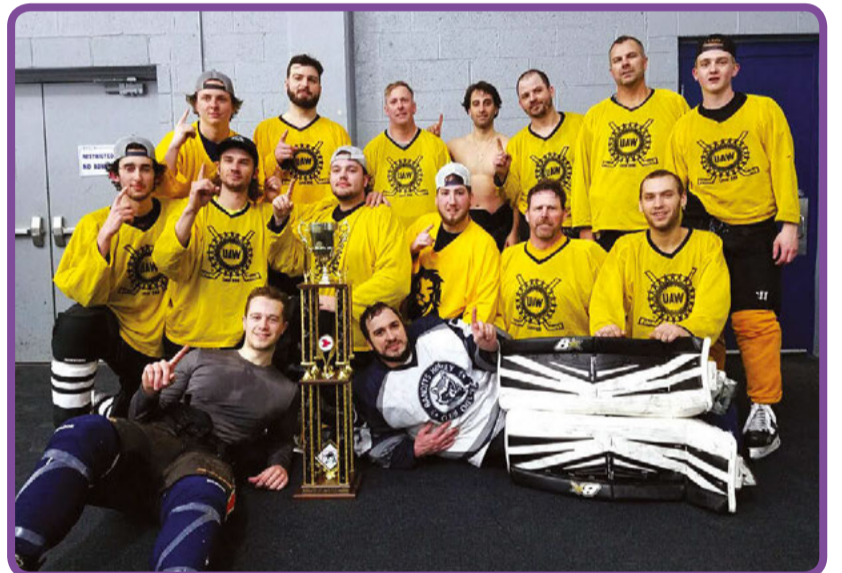
The Local 600 Hockey Team wins the championship with an overtime goal in just their third year skating together.

With under 10 seconds remaining, overtime was a given. As in most games of all sports, there is a brief moment, with the clock nearing zero, that players